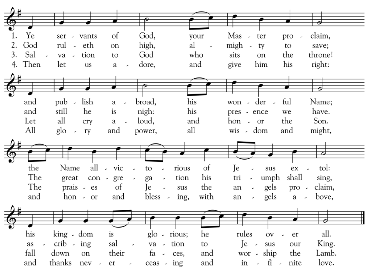
The All Saints' Adult Choir