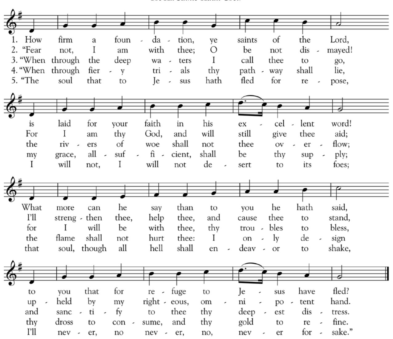
The All Saints' Adult Choir