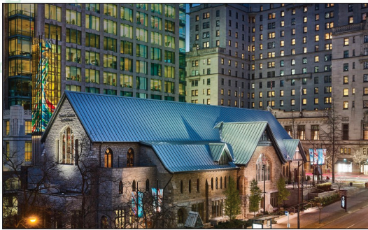
Christ Church Cathedral

We are fortunate to be a vibrant and healthy parish and envisioning the future of our block presents an exciting opportunity to look toward the future and build our legacy.