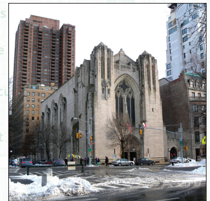
Church of the Heavenly Rest